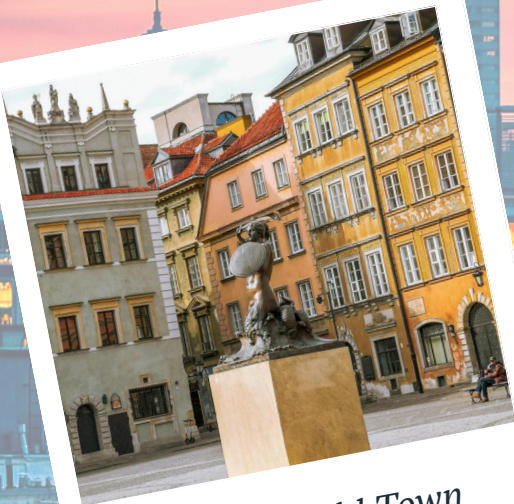
Warsaw Old Town

Set in the heart of Warsaw, Akademeia Summer School offers more than just academic enrichment. This vibrant European capital blends rich history with modern energy, giving students a unique cultural experience alongside their studies.