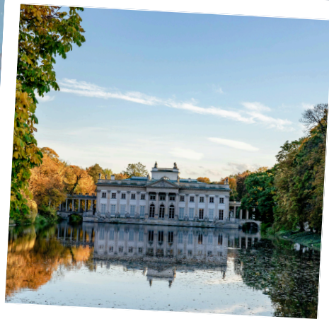
Royal Baths Park